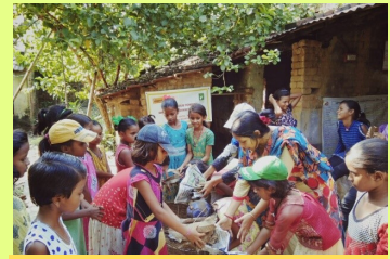
Bankura, West Bengal