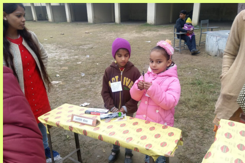
Children in Ganit Mela Haridwar, Uttarakhand

Child Rights Mission Week was organised among many learning centres with activities to increase awareness in community