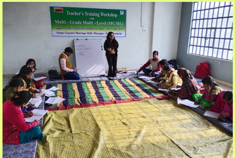
MGML Teacher Training in Mirzapur, UP