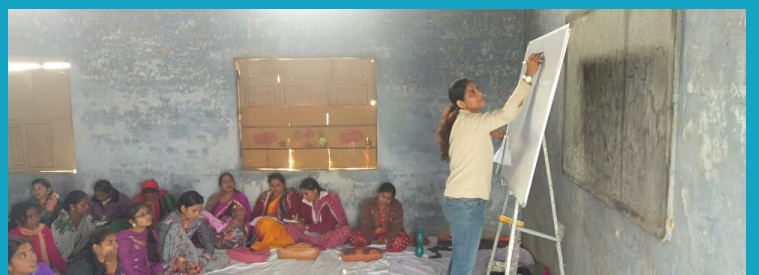
Teacher Training, Allahabad, UP