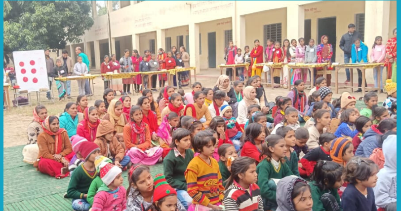
Ganit Mela, Haridwar, Uttarakhand