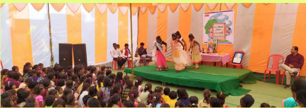
Child Rights Mission week in Khargone, MP

MG Motors Event was organised and girls were invited from the learning centres