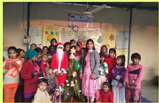
Christmas celebrations in Dehradun, Uttarakhand