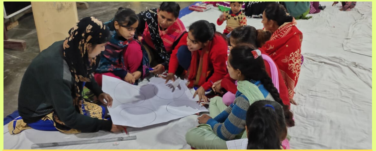
Quarterly Teacher Training in Saharanpur, UP

DTT workshops are conducted by external trainers or IIMPACT trainers directly with our teachers. 3 DTTs were held across the field locations in FY19-20 Quarter 3 (October-December). Jodo Gyan Training in Kanpur, Uttar Pradesh and Agastya Training in Purnea, Bihar and Kishanganj, Bihar were part of this.