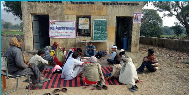
CMC meeting, Alwar, Rajasthan