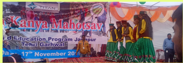
Titan Annual Function in Tehri Garhwal, Uttarakhand