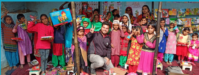
MG Motor Christmas visit, Mewat, Haryana