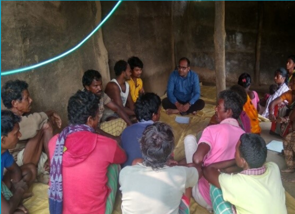
CMC meeting, Purulia, West Bengal

wishing all our readers a prosperous and big-hearted Happy New Decade and Happy New Year 2020!