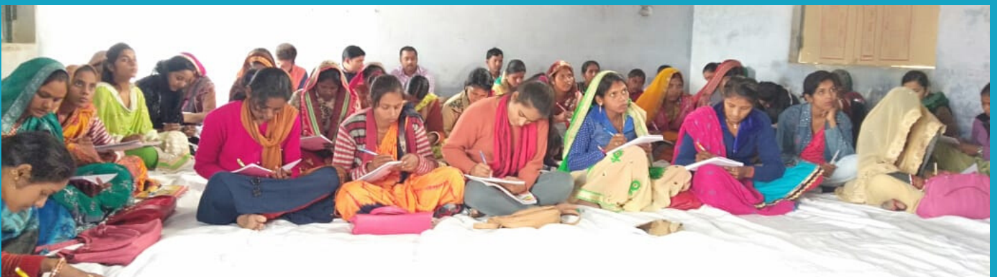
MGML Teacher Training in Allahabad, UP