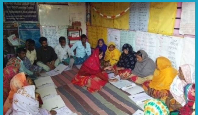
PTM, Pakur, Jharkhand