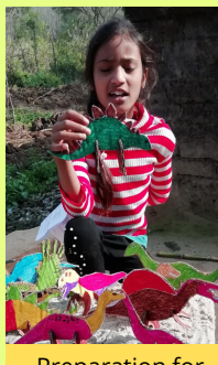
Preparation for Ganit Mela