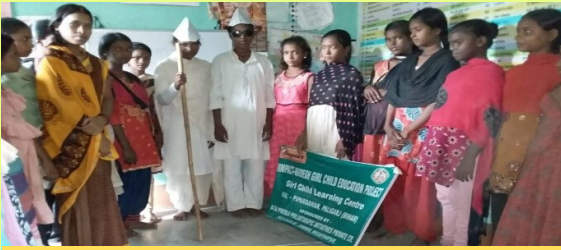
Gandhi Jayanti in Palliganj, Bihar