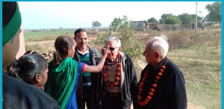
Donor visit, Sheopur, Madhya Pradesh