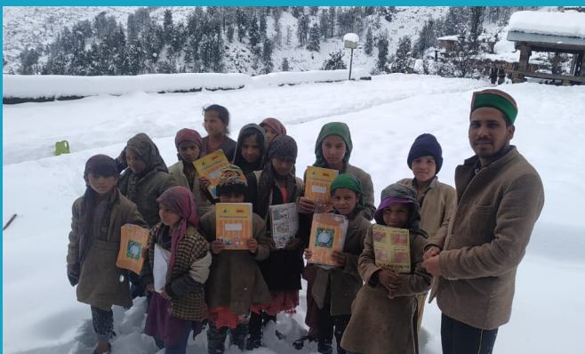
LC, Sirmaur, Himachal Pradesh