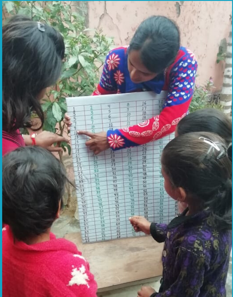
Ganit Mela preparations in Haridwar, Uttarakhand