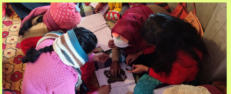
Direct Teacher Training in Kishanganj, Bihar