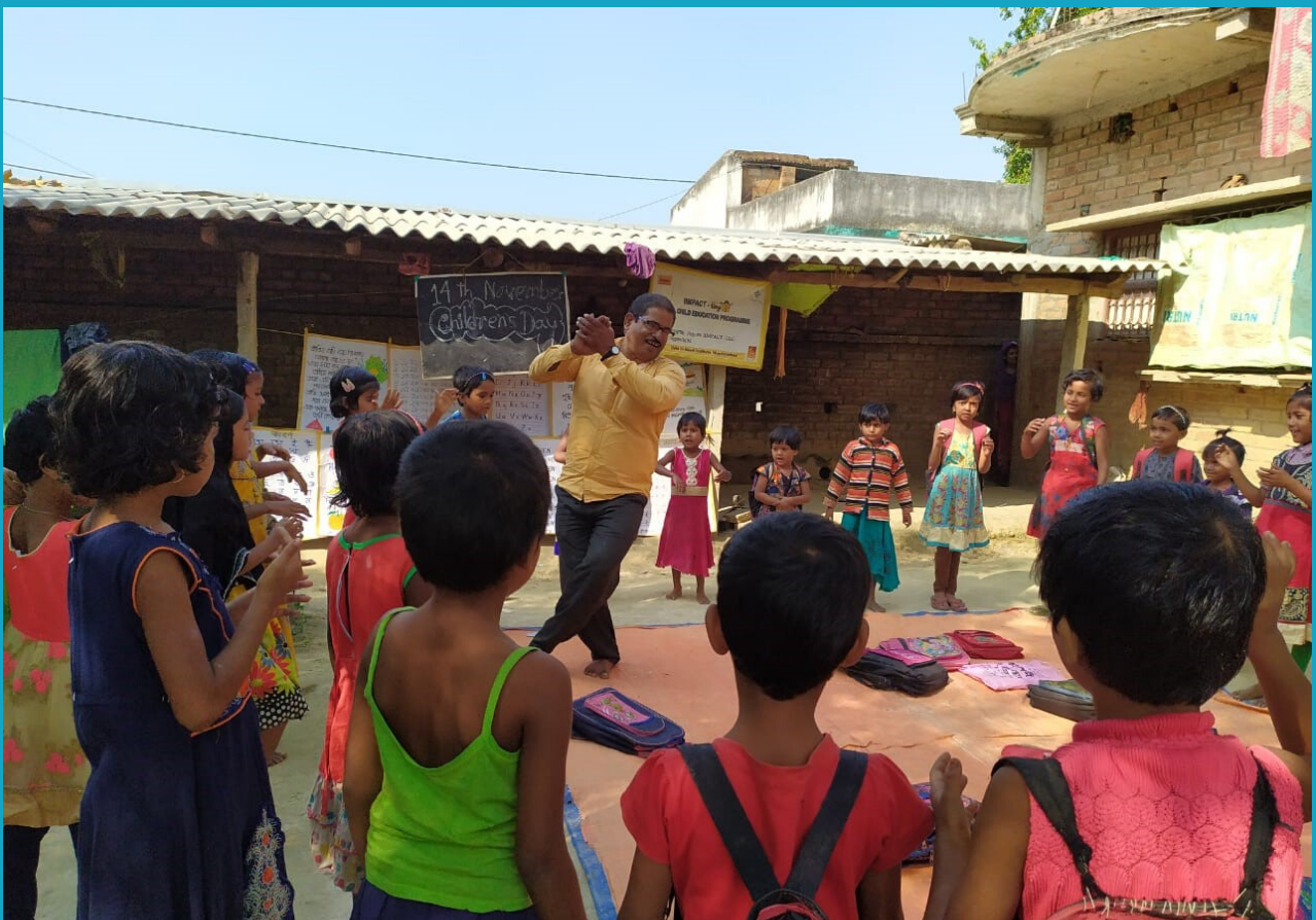
Children's Day in Murshidabad, West Bengal