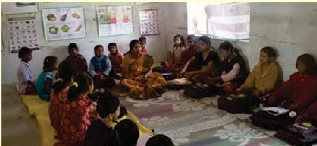
Learning Centre at Sujagolpur, South 24 Parganas, West Bengal

This incident has set an important example in the village and created an environment for the education of all girls till 18 years of age.