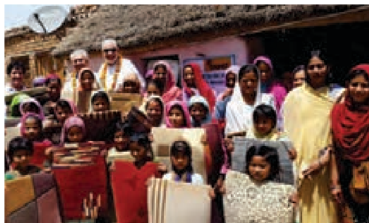
Doon School Old Boys Society visit