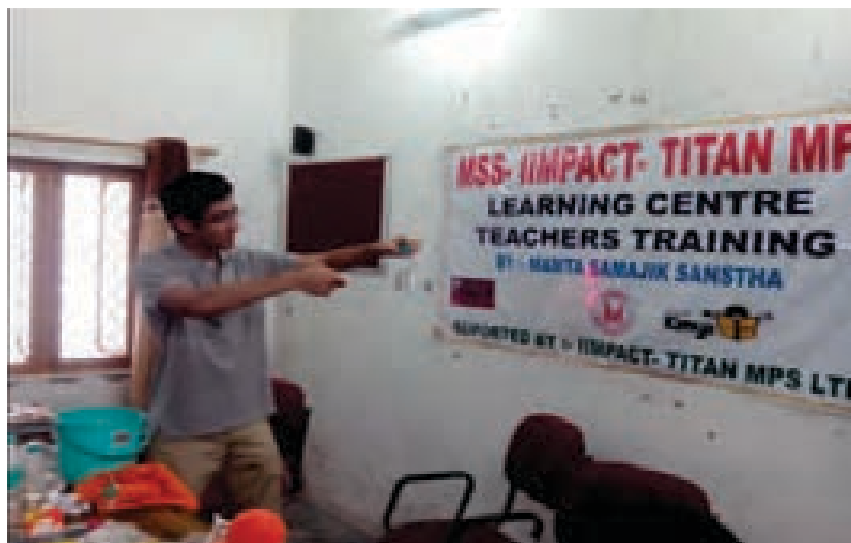
Experiment on the refraction of light

Each workshop spanned 2 days during which approximately 30 teachers were trained to perform 17 experiments. Four such workshops were conducted during the 10 day period, for teachers teaching at Premangar, Sahaspur, Vikasnagar (all in Dehradun), and Sirmaur (at the Uttarakhand-Himachal border).