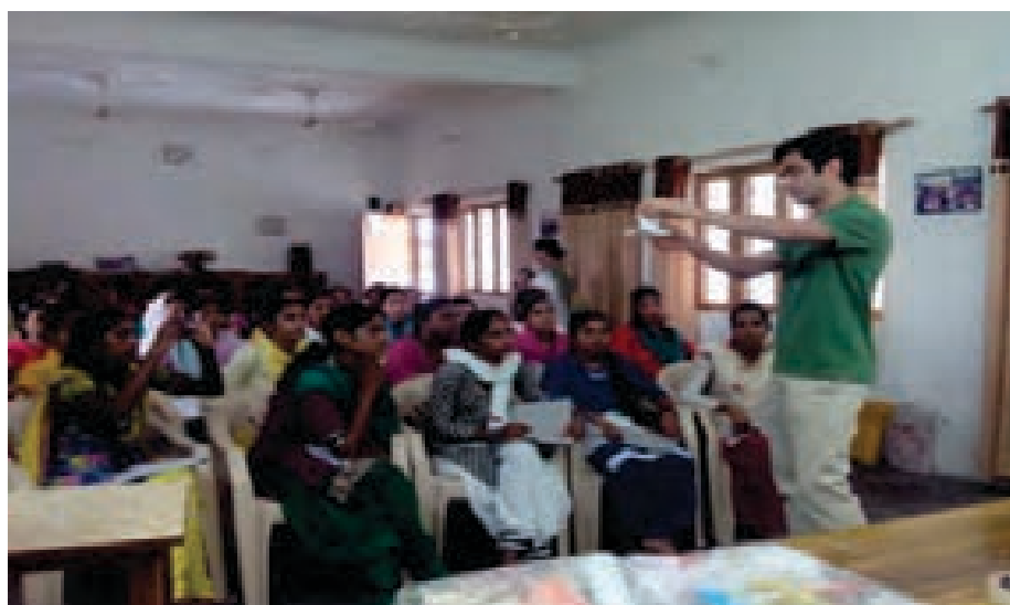
Building a helicopter from two thermocol cups

The feedback received from the teachers indicated that they had learned new skills from the workshop. Many of them had never taught science before this program. After this workshop, they believed that they were equipped to implement basic science lessons at their Learning Centers. Those who had been teaching science before the workshop felt that their earlier methods of reading from a textbook or having students copy notes from a blackboard could be supplemented with experimental hands-on learning.