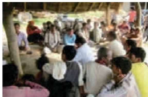
Community mobilization meeting in Shrawasti

The greatest strength of IIMPACT is community participation and their involvement at each level. Community mobilization is a process by which we reach out to different sectors of the community to create partnerships that focus on and address several social, structural and individual hurdles associated with the issue of girl child education.