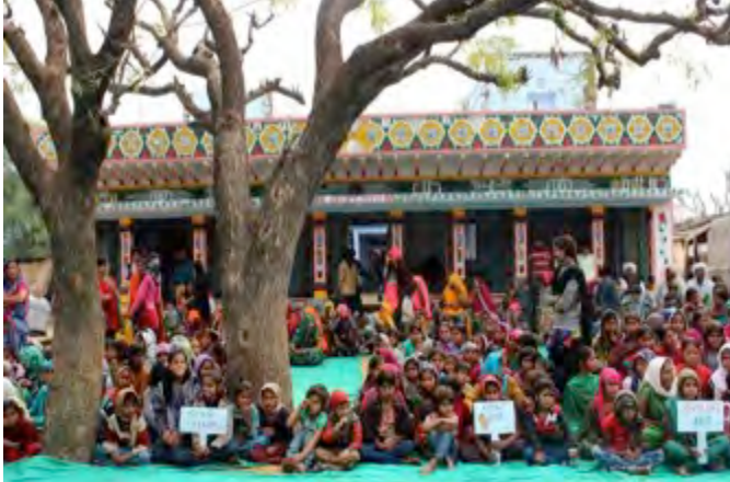
The Deutsche Bank Team

On 22nd Feb 2014, the CSR team of DBOI (Deutsche Bank of India) visited the IIMPACT learning centers.