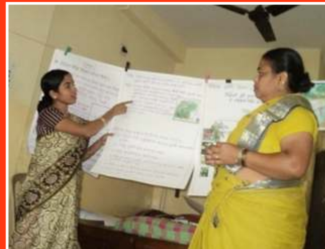
9 th -12 th March:Teachers Training in progress at Kolkata