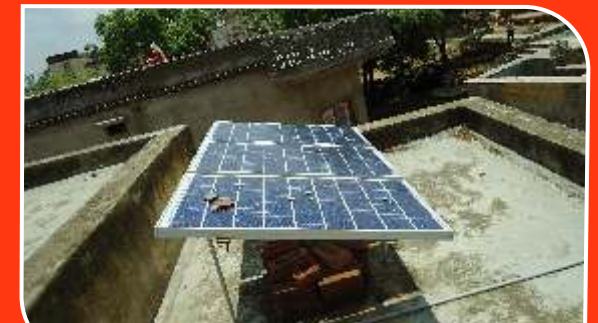
A solar panel at one of the centers at Alwar

In a place where electricity is available for only a few hours in the entire day, the solar panels have proved a boon to the girls. The crucial role it plays during exams is undeniable. These centers have become places where IIMPACT girls preparing for the class 5 exams come and study. Girls from the nearby villages too come to these centers and spend a couple of hours studying individually and as groups, sharing notes and helping each other.