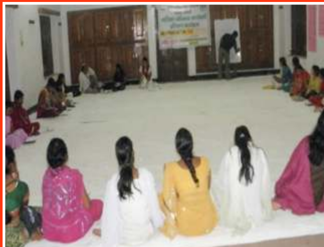
26 th -30 th March:Teachers Training at Shravasti