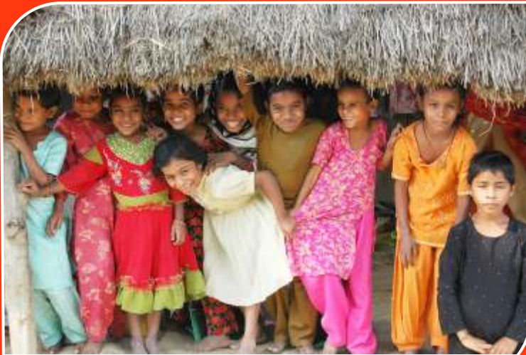
Their smile keeps us going!

The girls of IIMPACT, in attending the classes regularly have set an example for the other children in the village and have positively influenced the village communities in accepting education of girls as a necessity. The community elders welcome IIMPACT Learning Centers with open arms and encourage more and more families to send their daughters to study. This sea change in cultural principles is attributed to the dedication with which our girls attend the classes and the visible results and improvements in these girls.