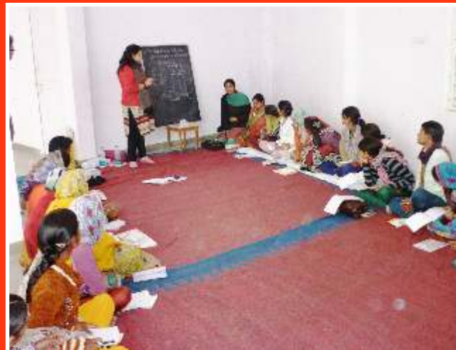
28th Jan- 1 st Feb:IIMPACT Project Officer(Training) conducting the training at Jamwah Ramgarh