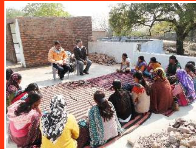
1 st -6 th Feb:Program Manager conducting the workshop at Kota