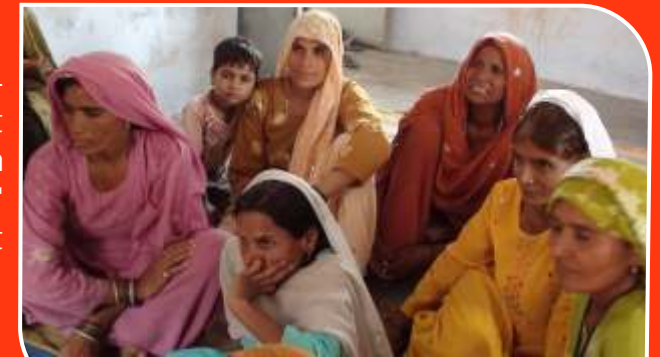
Mother visit the centers regularly

Mothers are now becoming incremental agents of change in the effort to prepare their daughters for this life-changing exam. They are now providing the time and space needed in their homes to ensure their girls have set out a significant amount of time to prepare for the exams. The daughters are not expected to spend too much time washing utensils, cooking food etc. These mothers come to the Learning Centers during 'extra study time' periods providing food to not only their children, but all the girls and the teacher(s) included, to help assure that everyone is eating healthy and nourishing themselves an important need during exams.