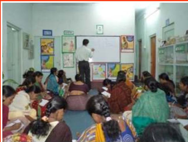
13 th Feb:Orientation on Child Rights and Protection for teachers at Diamond Harbour