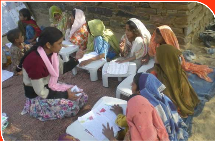
Our teachers are trained to give individual attention

A large part of our success-to-date in ensuring over 1600 girls from disadvantaged communities reach class V at our IIMPACT Learning Centers and have a 100% graduation rate is due to our Teachers.